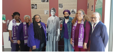
National Association of Colored Women's Clubs