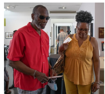
Juneteenth